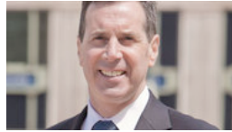
Who's getting promoted