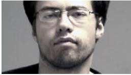
Mugs in the news