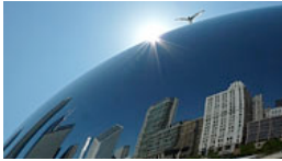
Your travel photos